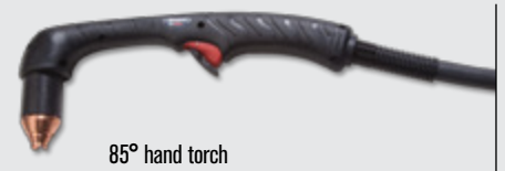
85° hand torch

(for more torch options, see www.hypertherm.com )