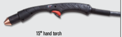
15° hand torch